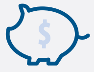
From your IRA