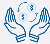
Donor advised fund